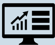
Custom Activity Dashboards