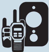
Wireless Nurse Call System

ODIN Fahrenheit 2.0 is part of the ODIN Care Platform. A platform which provides a variety of powerful solutions proven to improve communication, safety, and productivity in healthcare facilities.