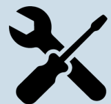
Custom Engineered Solutions

Contact us to learn more about ODIN Fahrenheit or the ODIN Care Platform (800) 475-5852.