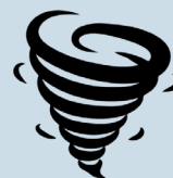
Critical Event Notification